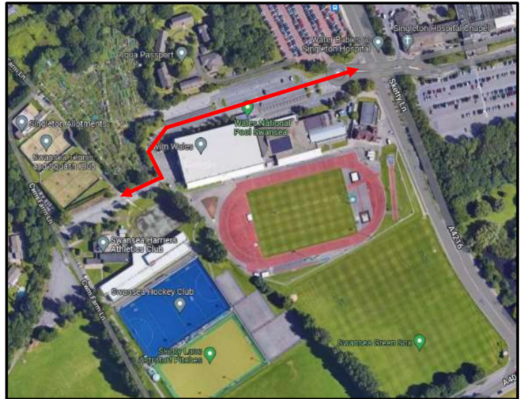
Figure 2 - Access/egress via Wales National Pool

Vehicles will NOT be penalised for entering/exiting car park B via Wales National Pool. The ANPR system is designed to monitor vehicles entering/exiting the chargeable area (car park C) at both the main entrance and the rear of the Pool.